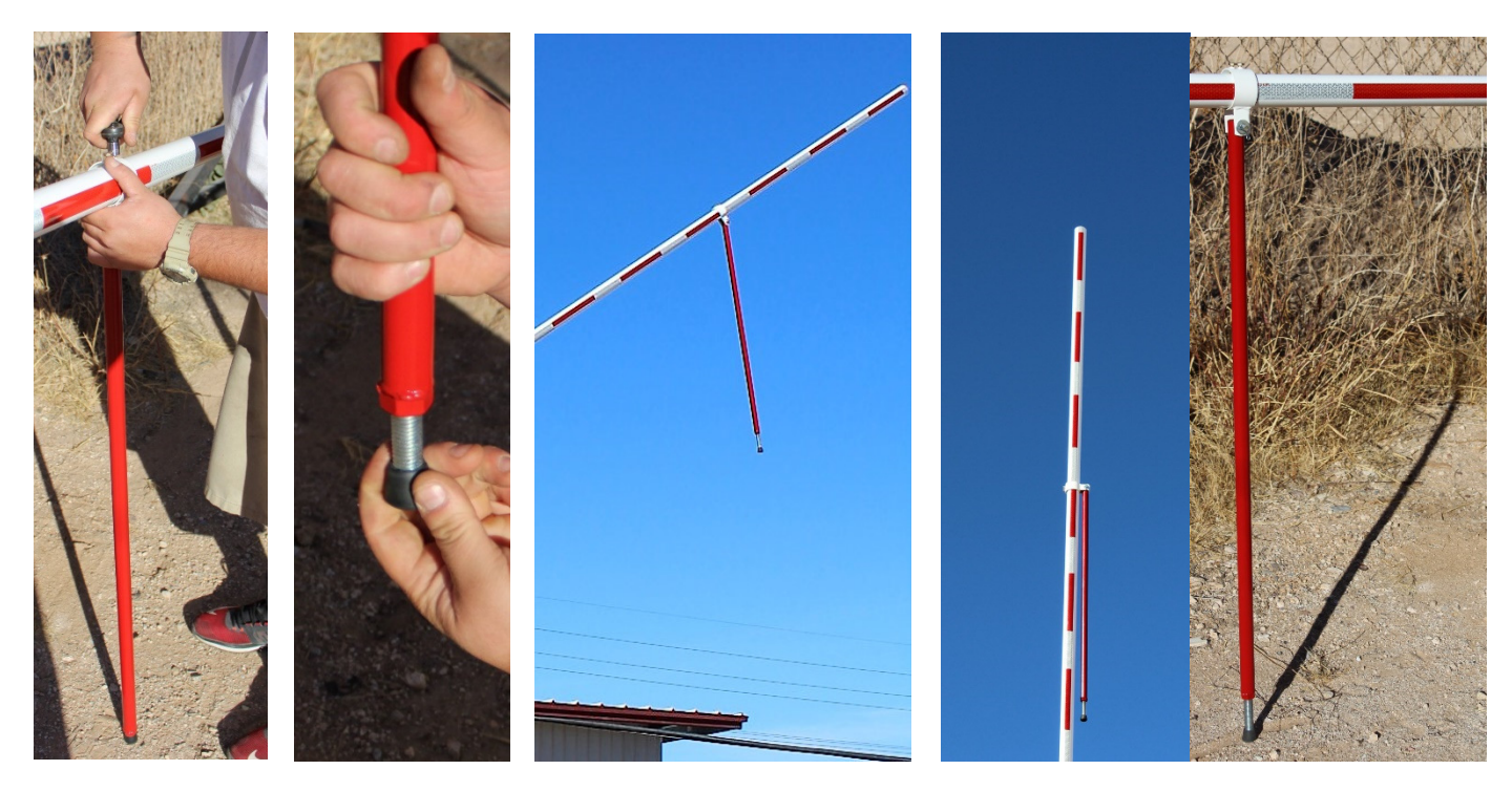
Step 10: Remove the bolt from Step 3 and Step 5 that is keeping the unit secured in the horizontal position.

If you purchased a unit that includes a Cable Truss Support go to page 6 & 7 before installing this pendulum support post. You will need to install the cable clamp bracket before the pendulum support.