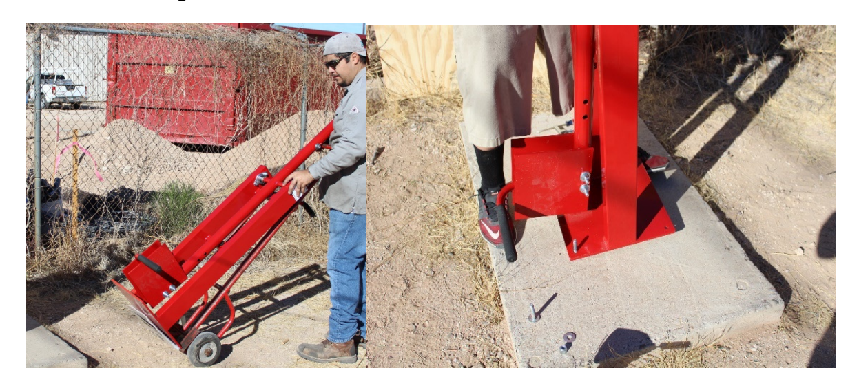
Step 3: Remove the bolt and nut that is holding the unit in the upright shipping position, set bolt and nut aside, you will need it later in the installation process. Use a 9/16" socket.

Step 2: Bolt base unit to the concrete or concrete pad. Anchor Bolts are not included. Purchase ½" diameter and 6" to 8" long.