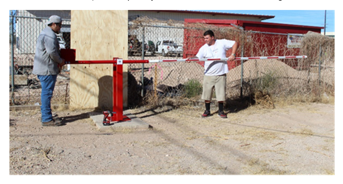
Step 7: Secure with the provided bolts and washers and tighten. Use a ¾" socket.

Step 6: Insert the white/reflective striped barrier arm section with the two holes into the red receiver tube on base unit. (See Step 8 if your unit has a barrier arm longer than 12 feet).