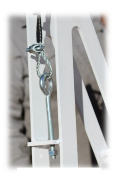
Use 9/16" socket to turn bolt, this will tighten the cable and straighten the arm